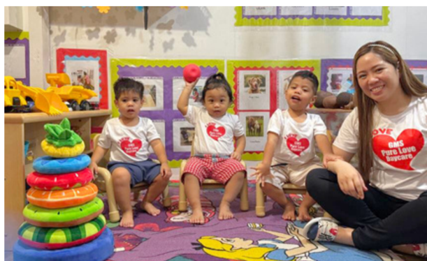
PL 1 Toddler B