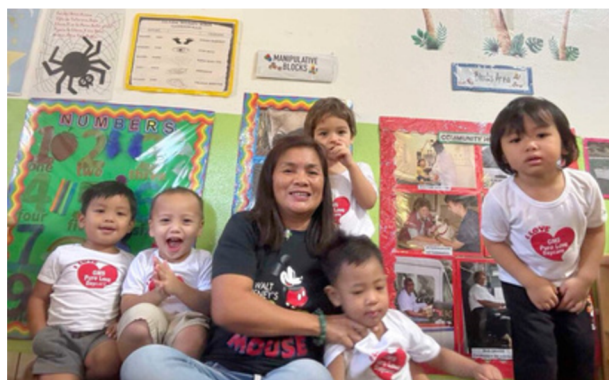
PL 2 Toddler