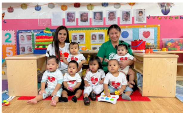
PL 1 Infant