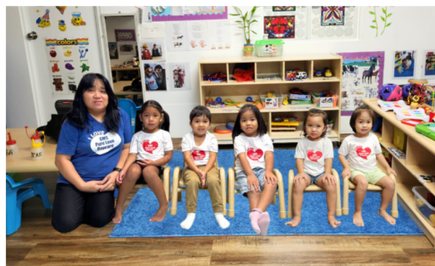
PL1 Toddler A