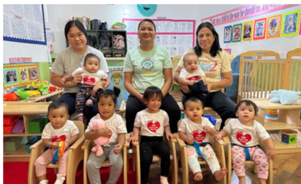
PL 2 Infant